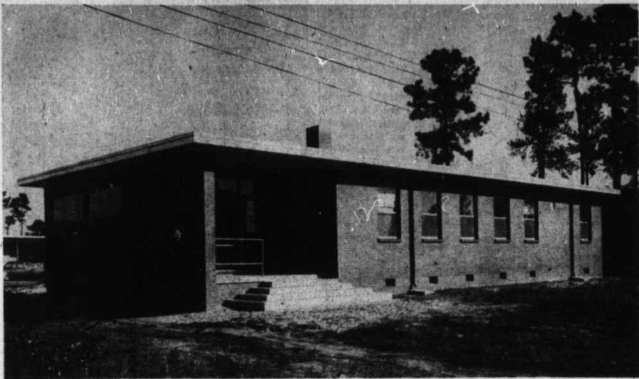
HEALTH CENTER—This photo of Pender County Health Center shows how Watauga county's public health building will look when completed.