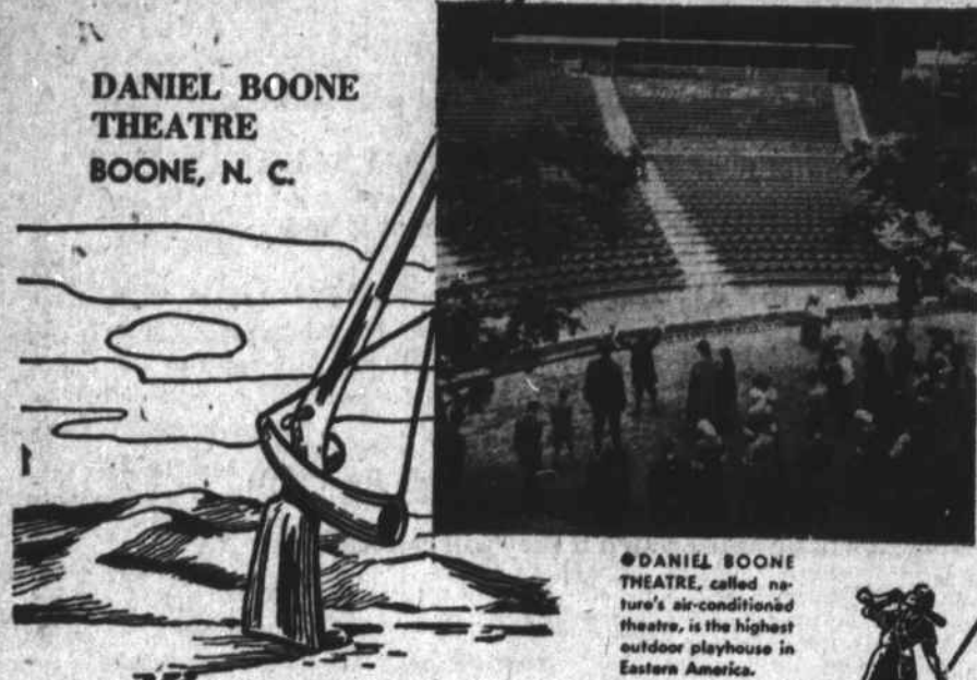
DANIEL BOONE THEATRE, called nature's air-conditioned theatre, is the highest outdoor playhouse in Eastern America.

NIGHTLY EXCEPT MONDAYS June 25 - September 5 8:15 P.M. 5 MILES WEST OF PARKWAY