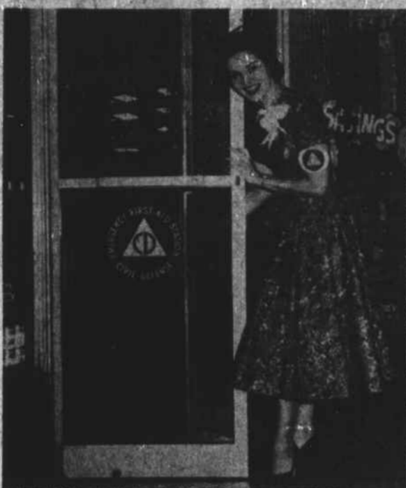
Miss America offers a timely tip on where to go for help if the bombs start falling. Shown posting the civil defense sign in a downtown Nashville, Tenn., drug store is Lee Ann Meriwether, Miss America for 1955.

Post-war Japan is becoming more Westernized.