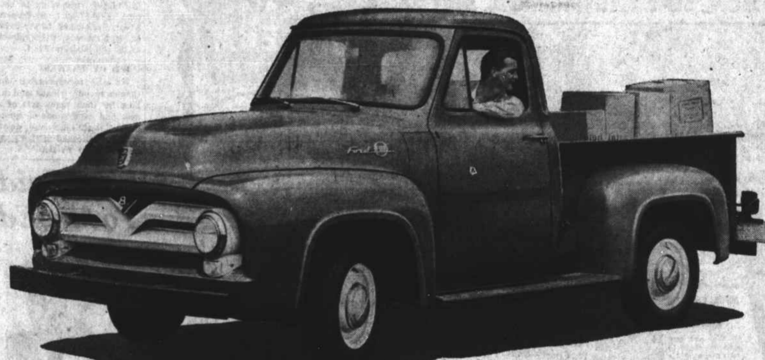
Ford 6 1/2-ft. Pickup gives choice of Short Stroke 132-h.p. V-8 or Short Stroke 118-h.p. Six. Tubeless tires standard. Fordomatic Drive and Power Brakes available at low extra cost. GVW 5,000 lbs.

Coming: "PETE KELLY'S BLUES" "SEVEN YEAR ITCH" "VIRGIN QUEEN"