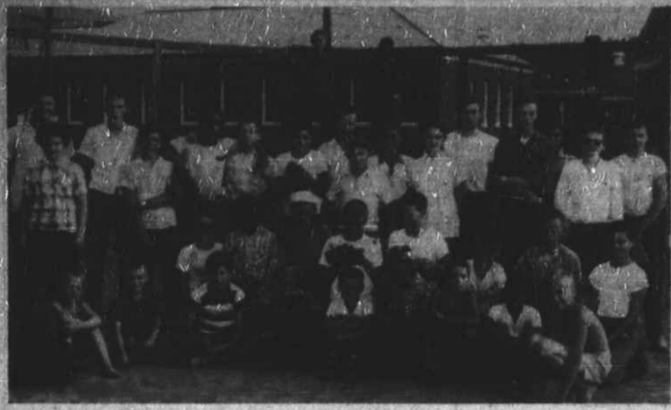
RECREATION PARTICIPANTS. Those who participated in the town recreational program are shown just before they enjoyed a picnic of hot dogs and cold drinks.