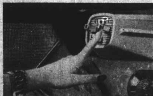
THE MAGIC TOUCH OF TOMORROW

Born of Success to Challenge the Future!