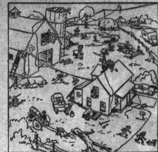
How many hazards can you find?*

SAFETY , a crop to be harvested on every farm and in every home, is receiving special attention from more than one-half million 4-H Club members taking part in the 1955 National 4-H Safety Program.