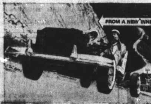
FROM A NEW 'INNER CAR' PROVED IN ACTION

came the magic that made possible so wonderfully different a Ford. In the toughest on-the-road tests ever given to a car, this "Inner Ford" demonstrated that a '57 Ford rides without a bobble, the curves without the pitch... and, that in power, it "takes nothing from nobody!" Nothing on wheels hurries, handles or holds up like a Ford!