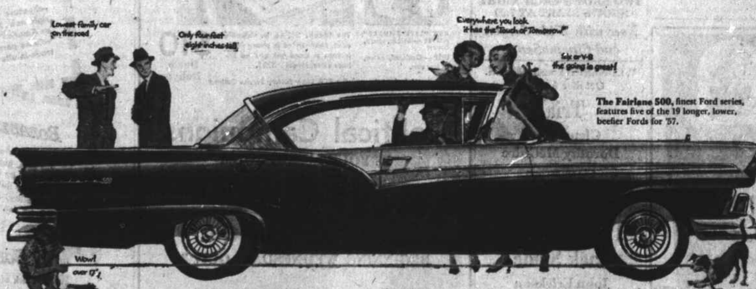
Lowest family car on the road