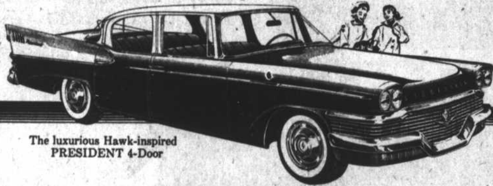
The luxurious Hawk-inspired PRESIDENT 4-Door