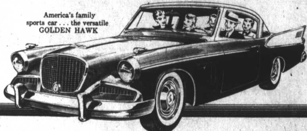
America's family sports car... the versatile GOLDEN HAWK

This year, Studebaker-Packard steps away out front in automotive styling, value and performance. New longer, lower Flight-Stream silhouettes mark the entire line... from America's lowest-priced, full-sized automobiles, the famous Scotsman series—to the brilliant new President, Commanders, Champions and the famous Golden and Silver Hawks. Graceful Hawk-inspired fins, new grilles and dual headlights set in jet-sweep nacelles give these new cars a dashing appearance, in the best of taste. Interiors, too, set these '58 Studebakers apart... from color-correlated, deeply cushioned upholstery to safety cone