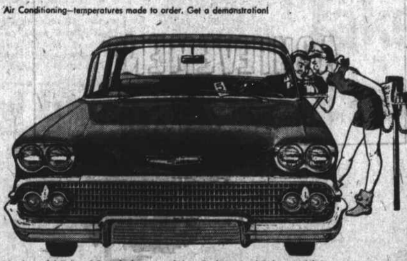
The beautiful Delray 2-Door Sedan, one of three budget-priced Delray models.