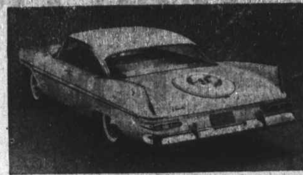
1959 PLYMOUTH FURY 2-DOOR HARDTOP

REGISTER FOR FREE PONY To Be Given Away Saturday At 4 P. M. Free Refreshments Thursday