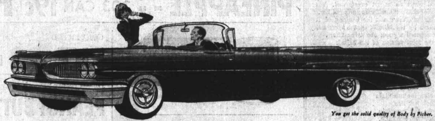
You get the solid quality of Body by Fisher.

... starts with the wonders of wide-track wheels