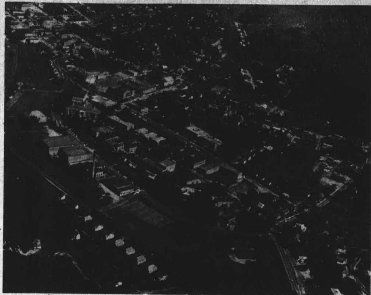
AIR VIEW OF CAMPUS —Most of the buildings of Appalachian State Teachers College are shown in this newest aerial shot. The high school and elementary school are shown at the northwest of the picture with a sweeping view of the Campus to