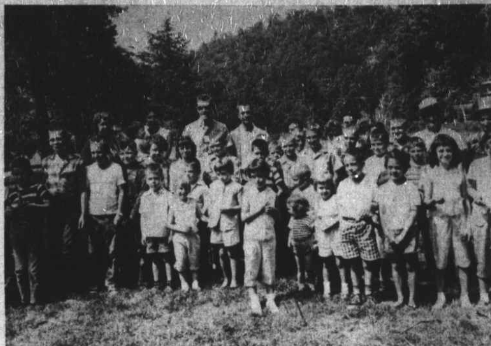
RODEO FISHERMEN AND PARENTS

This section of the Parkway will not be opened to public use until after the dedication.