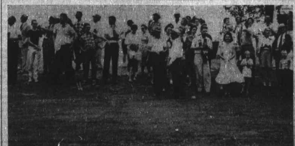
CROWD AWAITS OPENING OF BOONE'S CHAMPIONSHIP GOLF COURSE