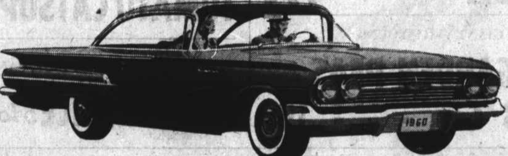
There's nothing like a new car—and no new car like a Chevrolet. This is the 1960 Chevrolet Bel Air Sport Coupe