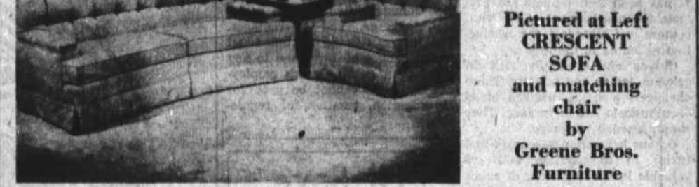
Pictured at Left CRESCENT SOFA and matching chair by Greene Bros. Furniture