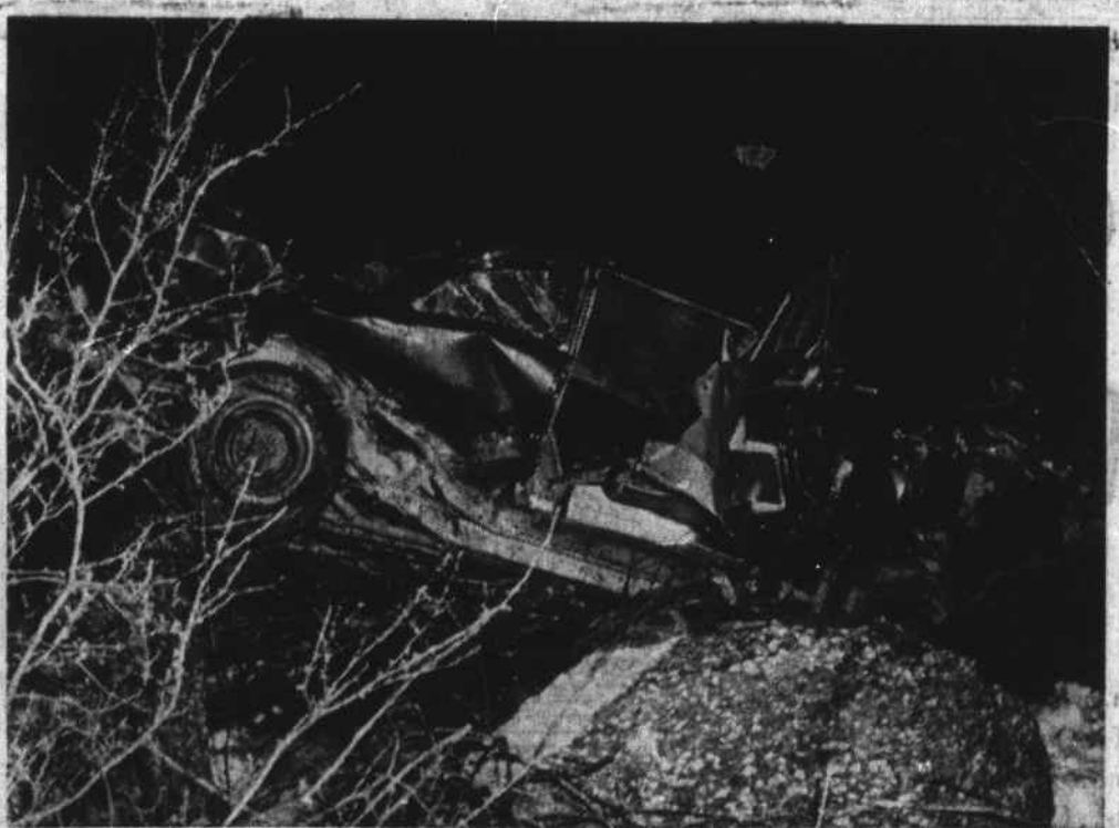
FATAL WRECK. —One person died as a result of this wreck Sunday night, and four others were injured.