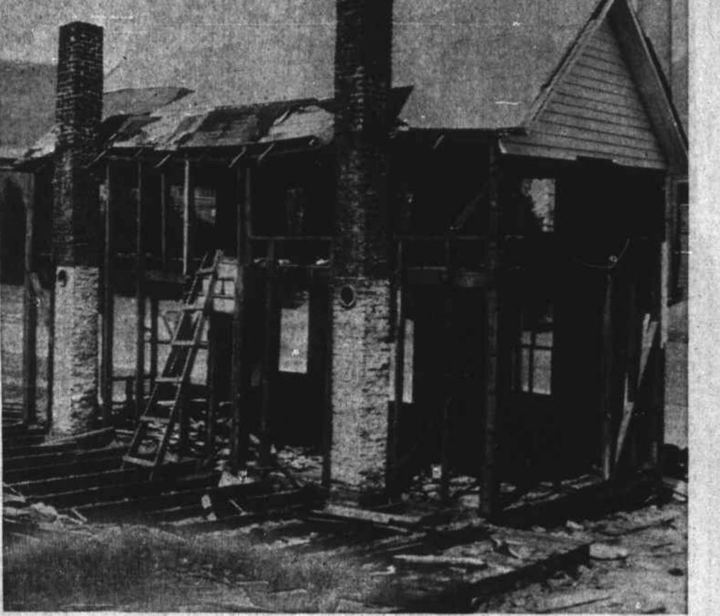
MAKING WAY FOR PROGRESS .- One of two houses being removed from site where college's Hom Economics building and Home Management House will be built. Work is expected to get underway on buildings this summer. Almost directly across Faculty Street from the Home Ec. buildings will be built an Industrial Arts plant. Work on this latter project is not expected to start until after the Hon Ec. buildings are begun.

The combined churches of Blowthe 29th Senatorial District sub- ing Rock will conduct a sunrise