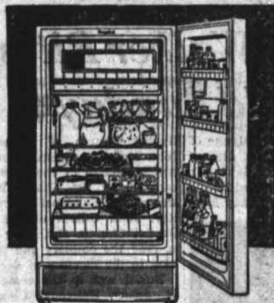
Model 129 EB-11