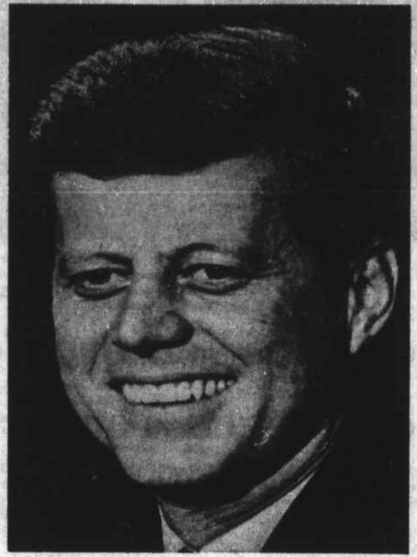
SENATOR JACK F. KENNEDY