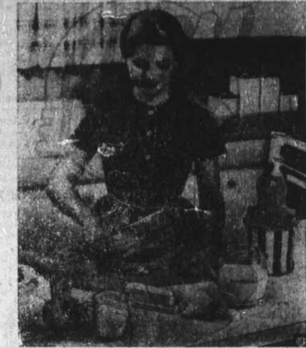
Speed is the key to effective stain removal. An easy rule to remember about stains is that a fresh one is easier to remove than an old one.

Most household stains—such as fruit, scorch, grass and light mildew—yield to a special solution of heavy duty dry chlorine bleach and detergent. Step one is to quickly rinse the stained area with cold water, then soak 5 to 15 minutes in a solution of 1/4 cup of dry chlorine bleach and one tablespoon detergent per quart of warm water. Always mix in a polyethylene plastic, glass, porcelain or enamel container. Rinse, and repeat if necessary. Colored fabrics, however, should be tested for colorfastness before treating.