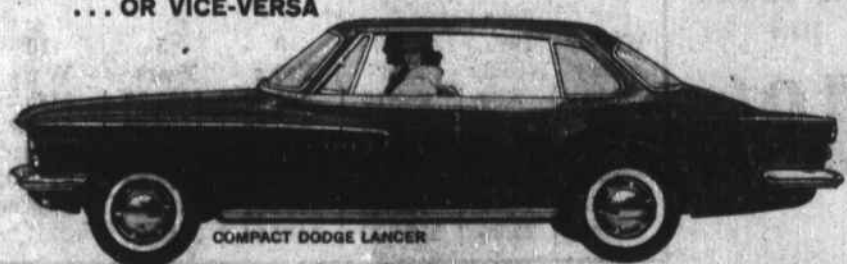
COMPACT DODGE LANCER

WHY YOU SHOULD BUY A DART INSTEAD OF A LANCER