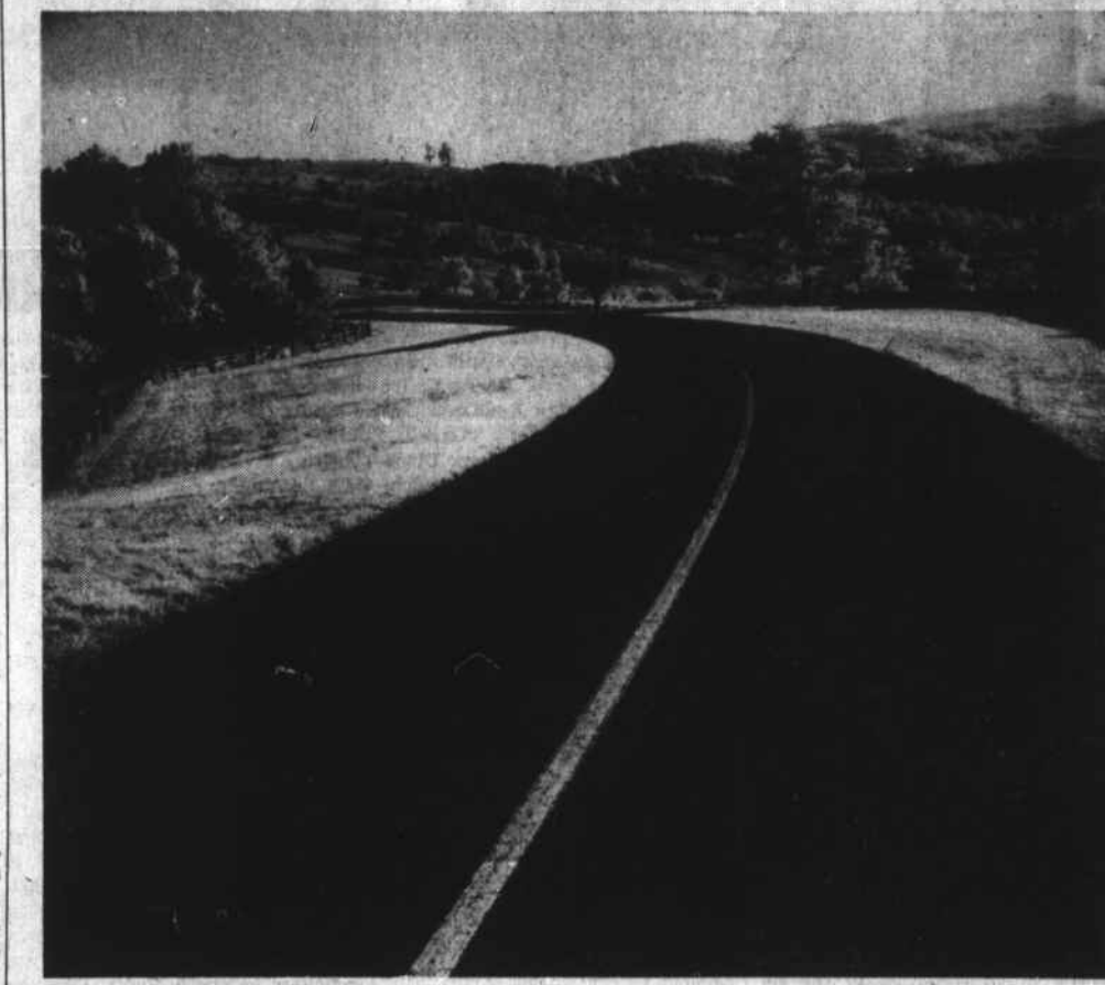
BLUE RIDGE PARKWAY BLOSSOMS ATTRACT MANY VISITORS TO MOUNTAINS

Lucille N. Koon, Charlotte, Appalachian, physical education.