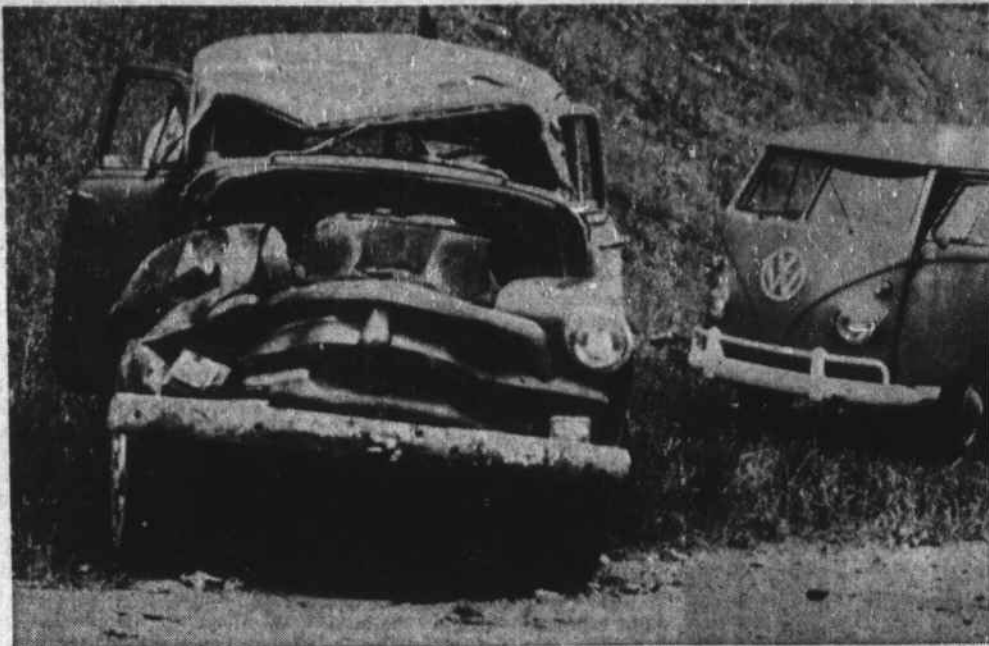
MAST CAR WRECKAGE AFTER BEING SET ON ITS WHEELS

The winner here will go to Elkin on June 5 to compete for the area princess, and the winner at Elkin will compete for the title of Dairy Princess, to reign during dairy month.