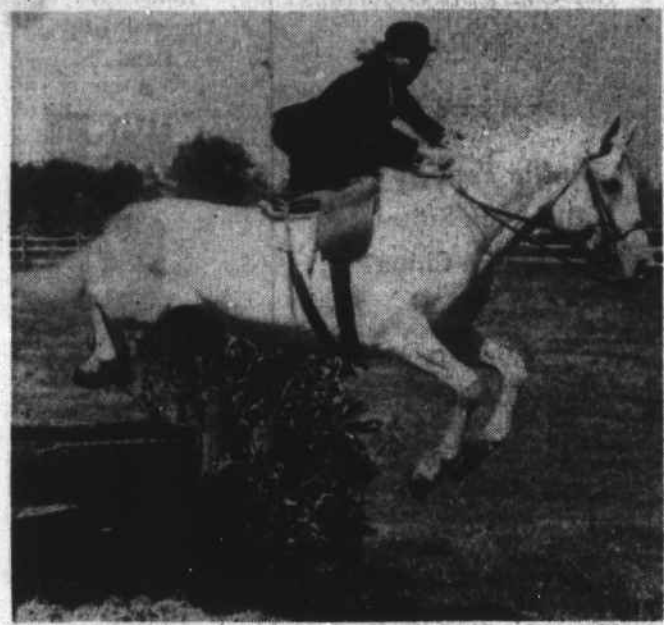
UP AND OVER.—This young rider and her jumper were photographed as they went over a hurdle at a recent Blowing Rock Horse Show. This year the event will be held for four days at Broyhill Park, August 3, 4, 5, and 6.

We Hope the Pictures and Stories in These Pages Will Intrigue . . . and That You Will Find Helpful Information About Services and Attractions That Will Make Your Visit a Most Enjoyable One.