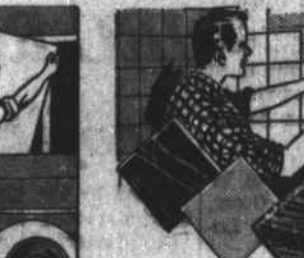
PLASTIC WALL TILE