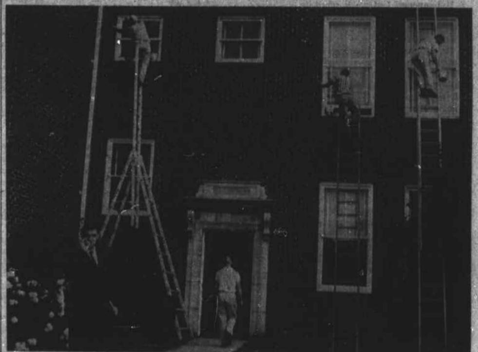
ASTC BUILDINGS get a new coat of paint as college gets ready for the start of the fall term.