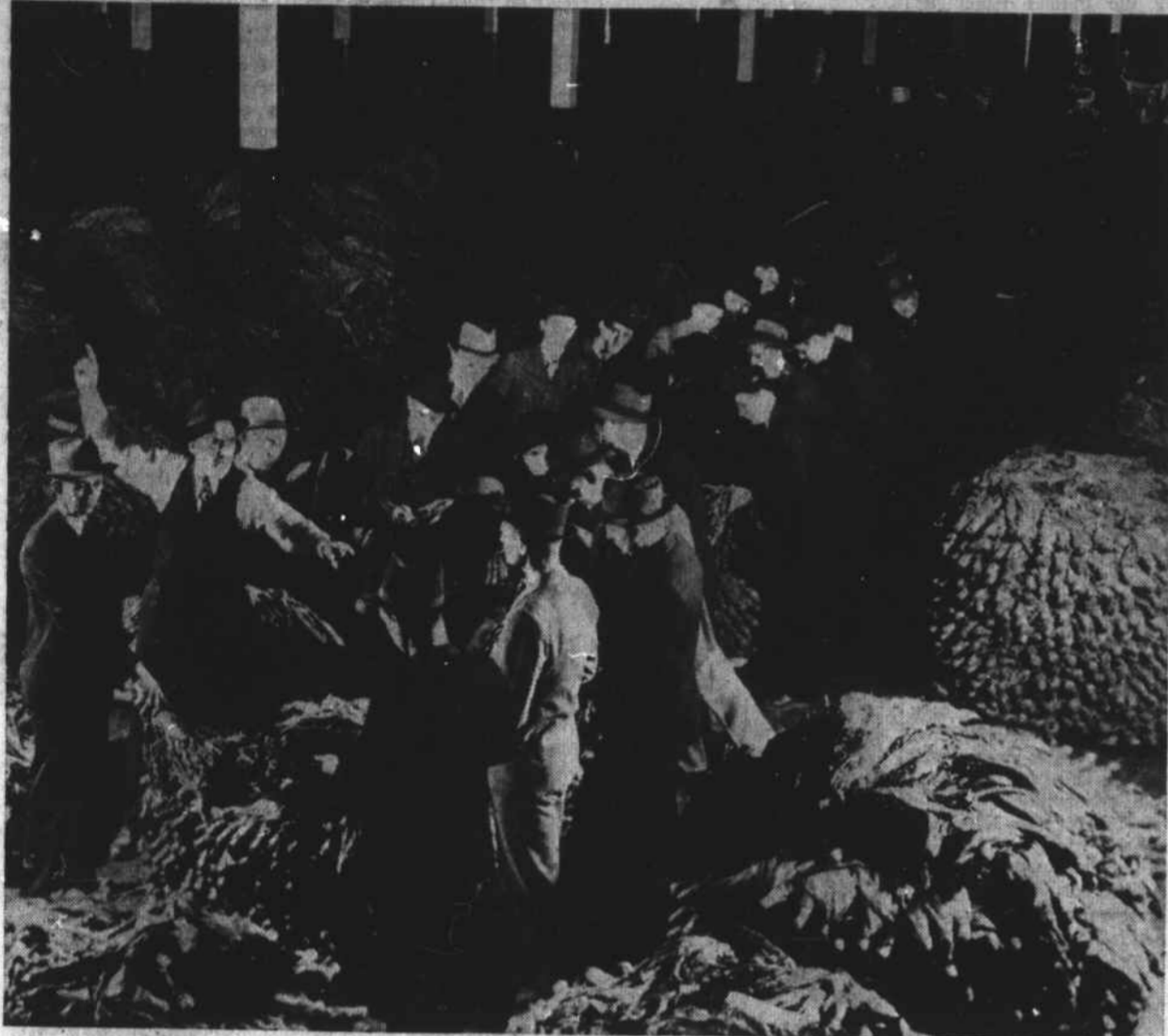
BURLEY MARKET OPENING. —When the auctions begin on the Boone market November 27, scenes like this will be repeated daily. Warehousemen, buyers, farmers, and others line up and pass between the rows of baskets as the auction-

eer's chants ring out through the warehouse for all to hear. Officials of both warehouse companies here say they are ready for the opening and predict good prices and offer what they describe as the best market in the area for farmers