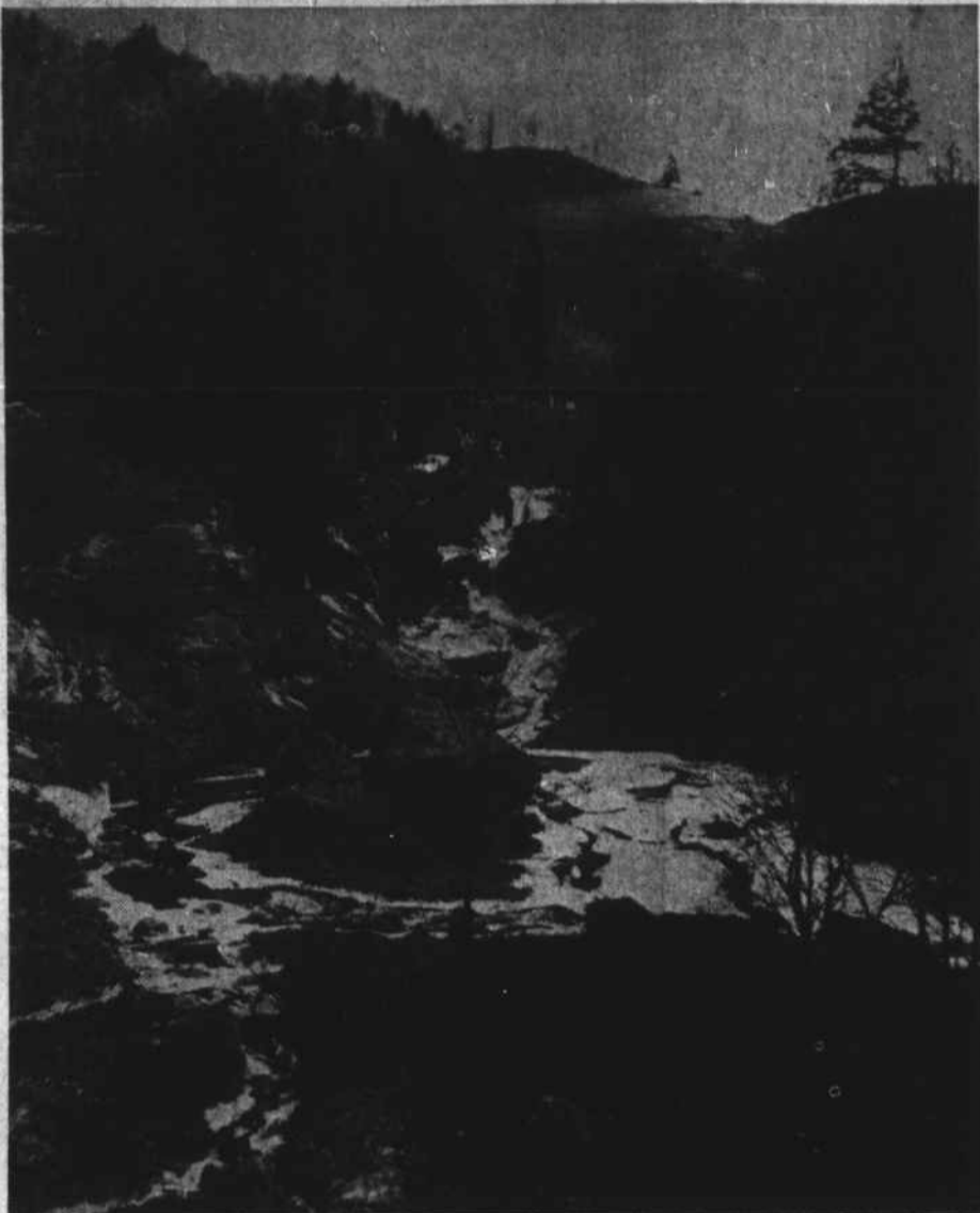
ICY STREAM.—Weather in the Watauga area gave little evidence last week of the severe weather which prevailed in this mountain county only days before. Most of the snow and ice had vanished by mid-week, although some of the more shaded areas remained locked in an icy grip. The above picture was made on U. S. 321, west of Boone.