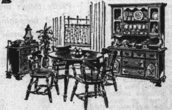
Rediscover the drama of an important dining area with the basic elegance of PENN COLONY.