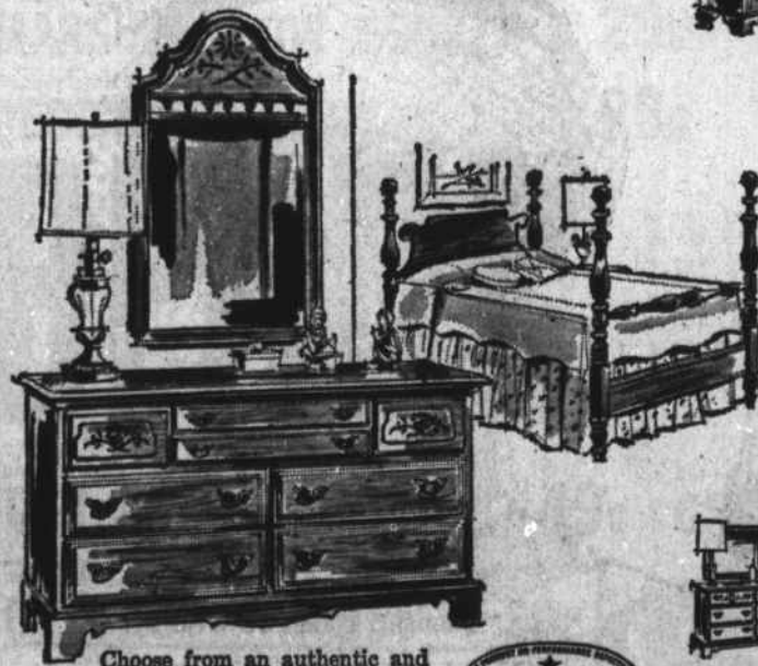
Choose from an authentic and wide selection of beautiful, dutiful bedroom pieces like these.