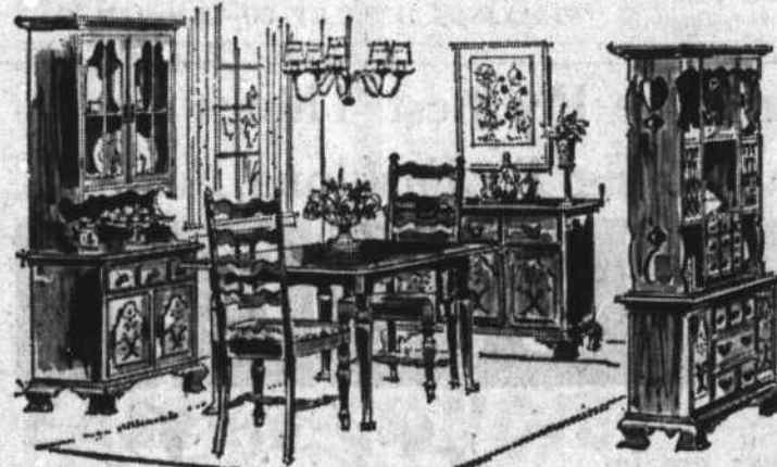
PENN COLONY's timelessness, interpreted in mellow Butternut woods, translates skillfully to a room of dining pleasure above.

WIN This exciting new Westcoast Transistorized Battery Movement Decorator Clock! Visit us today and register for this clock being given away FREE during April! Retail value $34.95. NO PURCHASE NECESSARY!