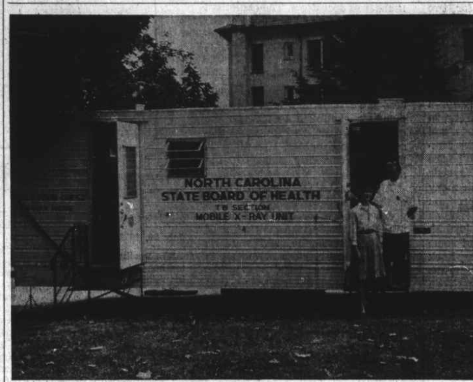
MOBILE X-RAY UNIT