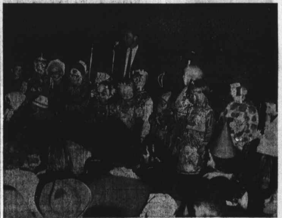
Some idea of the tremendous crowd which attended the Boone Optimist Club's Halloween Carnival may be given by this shot of the masses gathered around the speaker's

The road will be approximately twelve hundred feet in length and will have an excellent grade, according to highway officials.