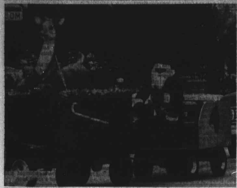
SANTA AND HIS REINDEER APPEAR IN CHRISTMAS PARADE—ON A TRAIN?