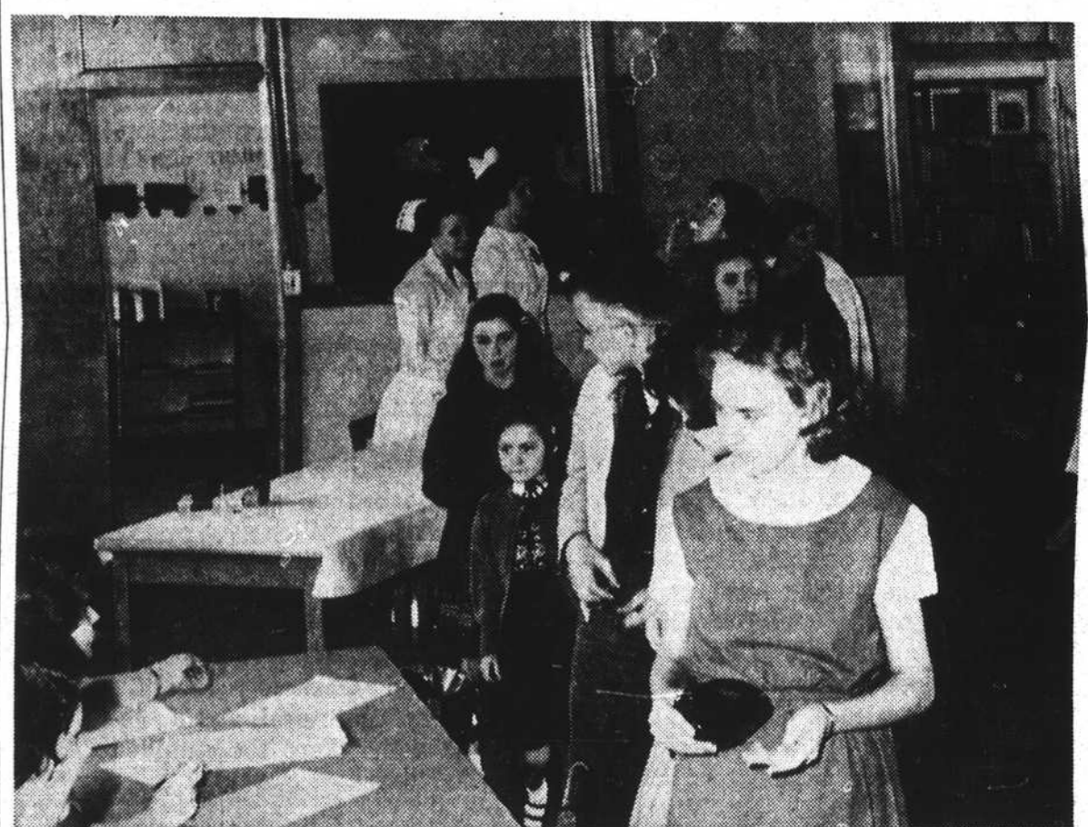
Citizens pass through the polio immunization line at Blowing Rock School Sunday afternoon during the county-wide effort to K-O Polio.