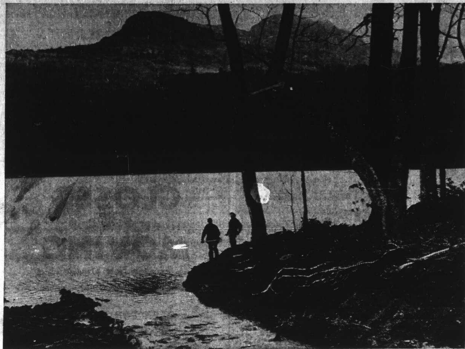
GRANDFATHER LAKE IS FULL