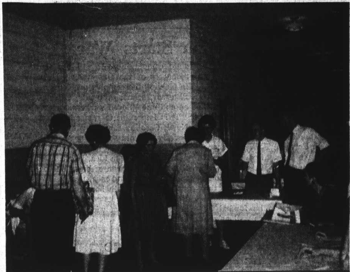
Citizens of Watauga County turn out to receive the second dose of Sabine vaccine at one of the four immunization clinics held Sunday.

Public Welfare is at all times interested in helping people help themselves, and for that reason is now establishing a roster of names of available workers. These persons are capable of doing work around the home, on the farm and in town. If you need someone to work, call the Welfare Department for referral. An honest effort will be made to assist.