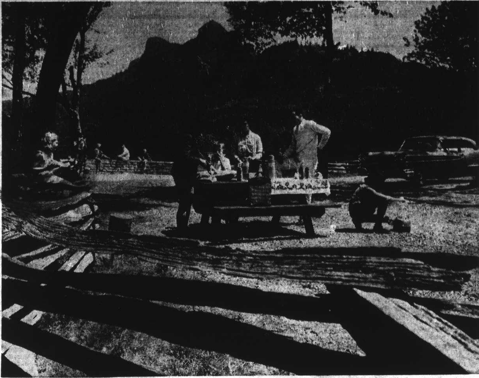
PICNICKING IN FULL BLAST IN GRANDFATHER MOUNTAIN AREA