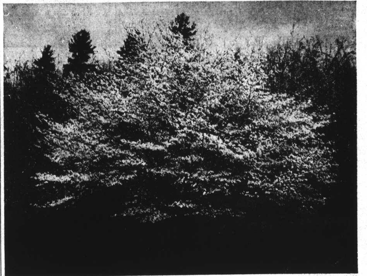
DOGWOODS ADD COLOR TO SPRING LANDSCAPE

Following the luncheon Senator Strong will speak at a rally at the court house. The public is invited to attend.