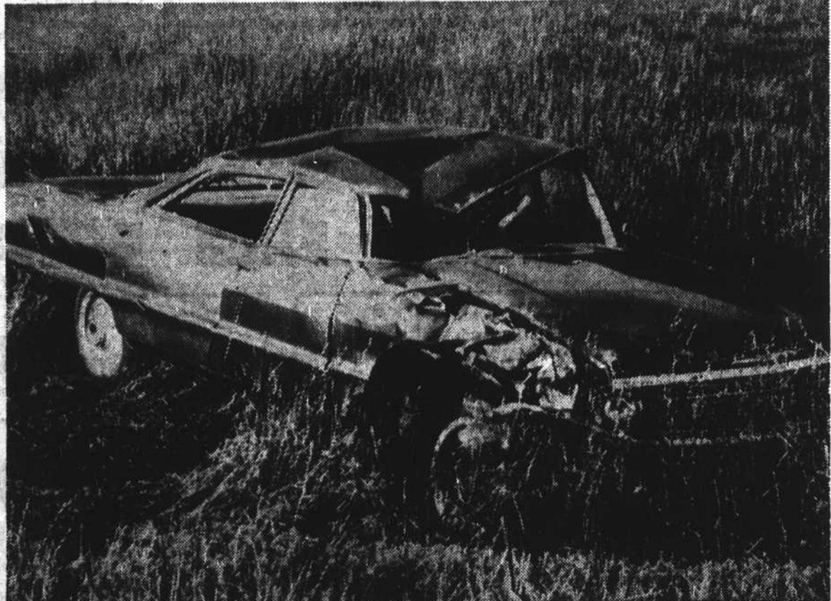
Car involved in accident on Highway 421 with farm tractor in which five were injured.