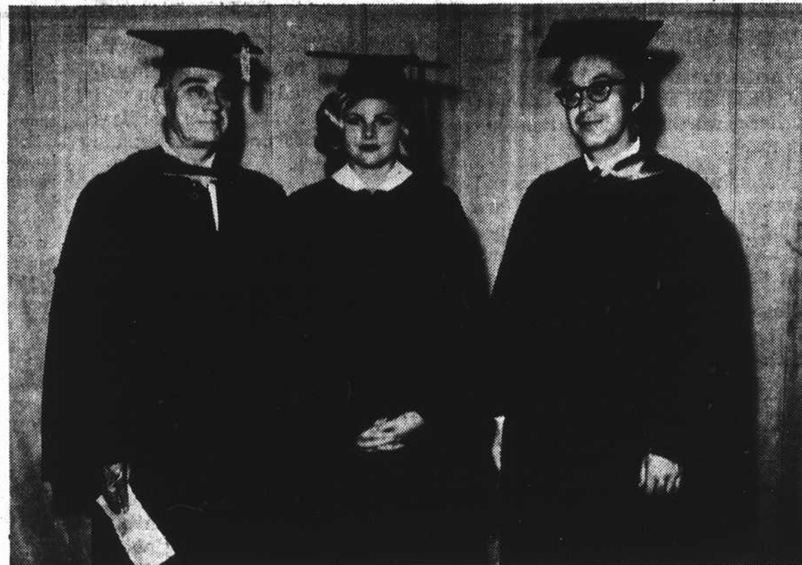
Summa Cum Laude