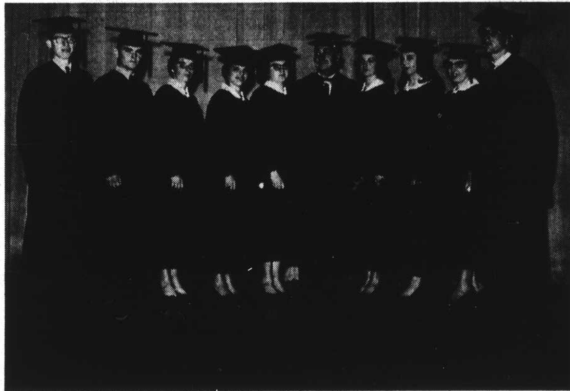
Magna Cum Laude

The 57-year-old former Superior Court judge from Canton, personally appeared before State Board of Elections Chairman (Continued on page 3, Sec. B)