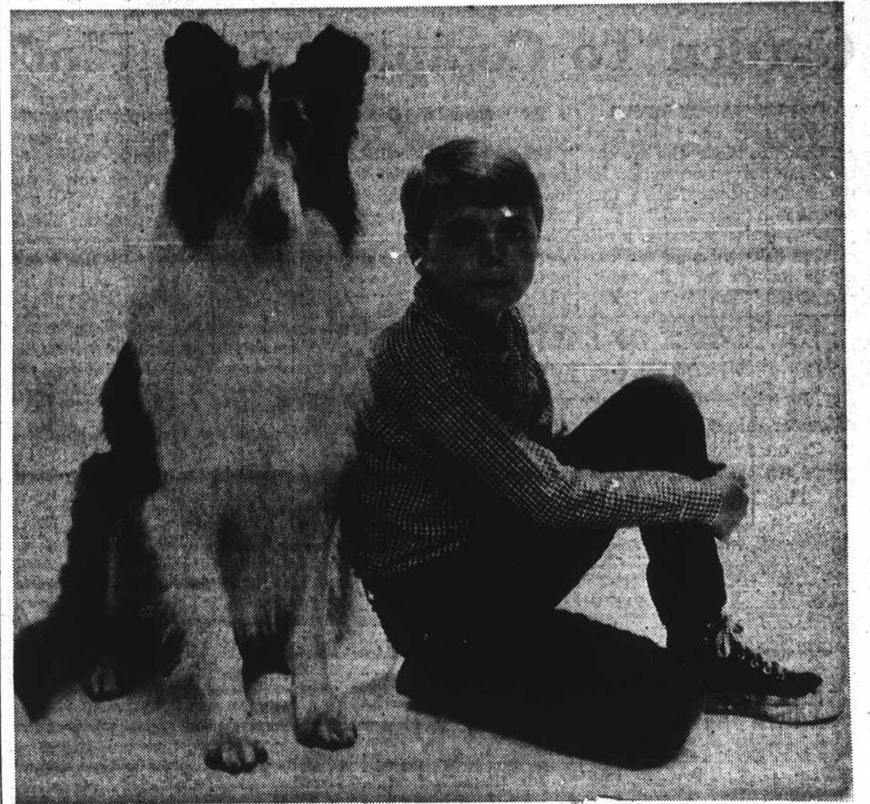
LASSIE AND JON PROVOST OF THE CBS TELEVISION SHOW, "LASSIE."

A high school camp is operating this summer on the campus of Lees-McRae College at Banner Elk. About 200 students have already enrolled in these classes.