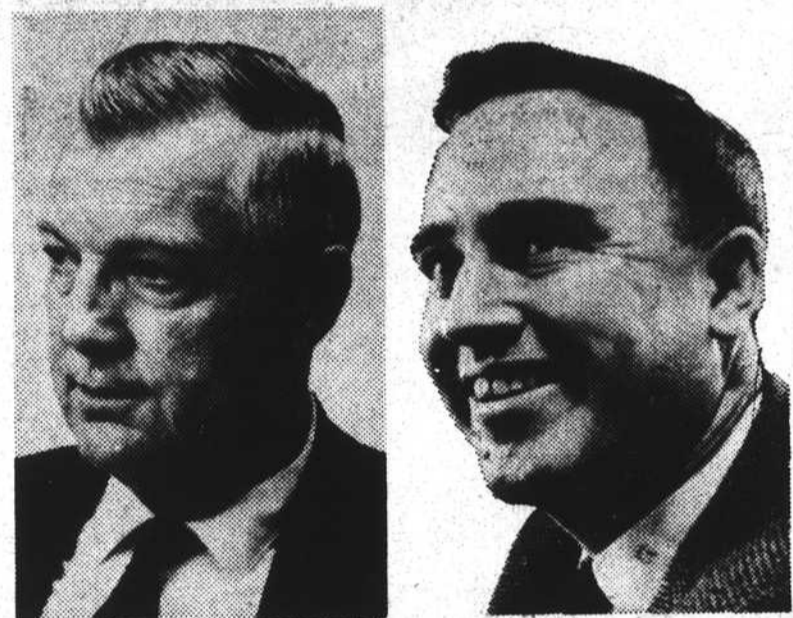
DAN K. MOORE