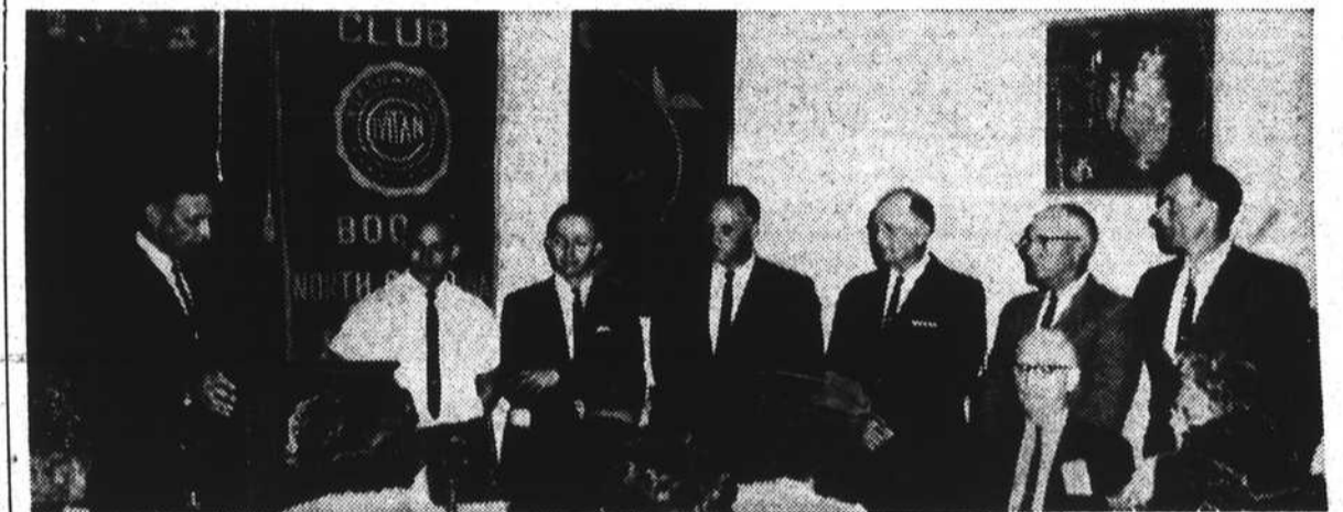
Installation Of Officers