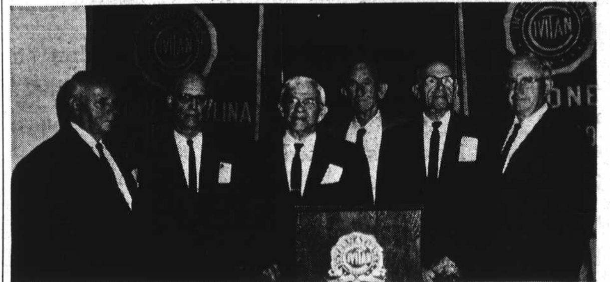
Original Civitan Club Members