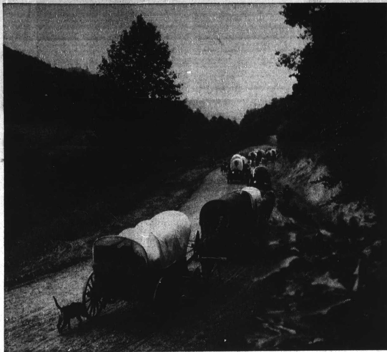
Wagons Roll On Boone Trail