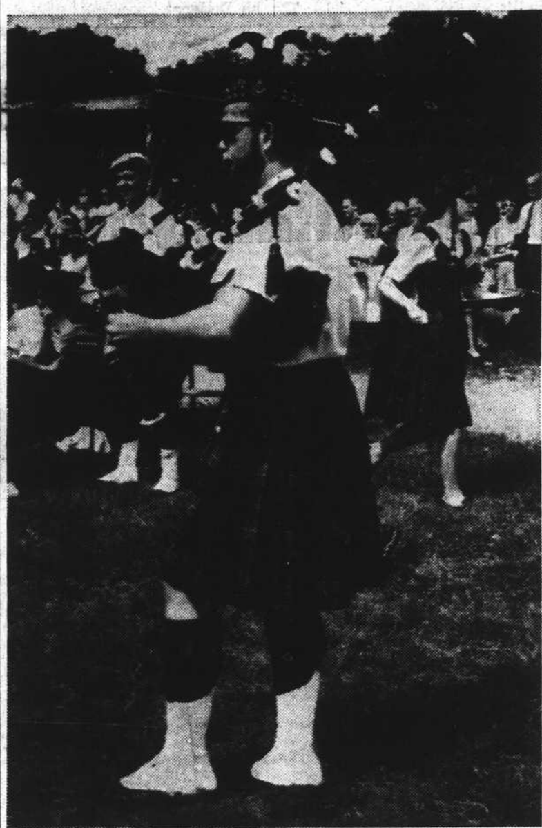
PIPED TUNES TO WHICH the lads and lassies danced the Highland Fling Saturday and Sunday at Grandfather Mountain. The Miami and Dunedin Pipe Bands performed and paraded during the three-day event.