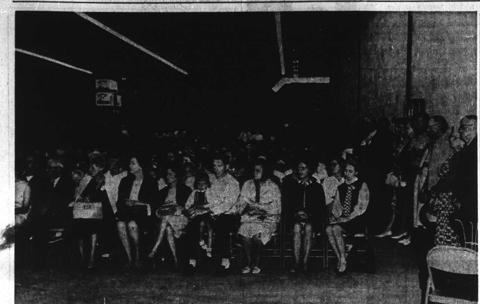
STANDING ROOM WAS ALL that was left Saturday when the Blue Ridge Shoe Co. opened its doors to citizens of