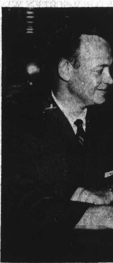
NINTH DISTRICT CONGRESSMAN James T. Broyhill is shown in Washington with former Rep. Walter H. Judd of Minnesota. Dr. Judd, an outstanding foreign policy spokesman who delivered the rousing keynote address at the Republican National Convention in 1960, will be the principal

Hon. Walter H. Judd, former Congressman from Minnesota, will be the guest speaker. Dr. Judd, one of the leading statesmen of the Republican Party, is recognized as one of its outstanding speakers. His life as physician, missionary, congressman, U. N. delegate, and lecturer has prepared him well for his position in the Republican Party.