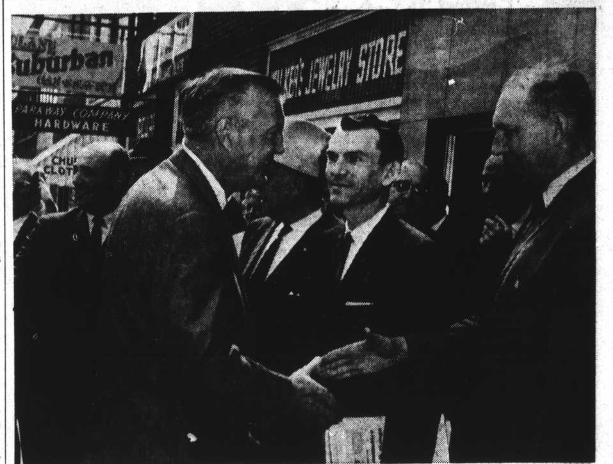
DAN K. MOORE (left) was heartily received when he came to Boone last week. The Democratic gubernatorial candidate made an eight-county tour through Western North Carolina. Accompanying him were his wife and daughter.