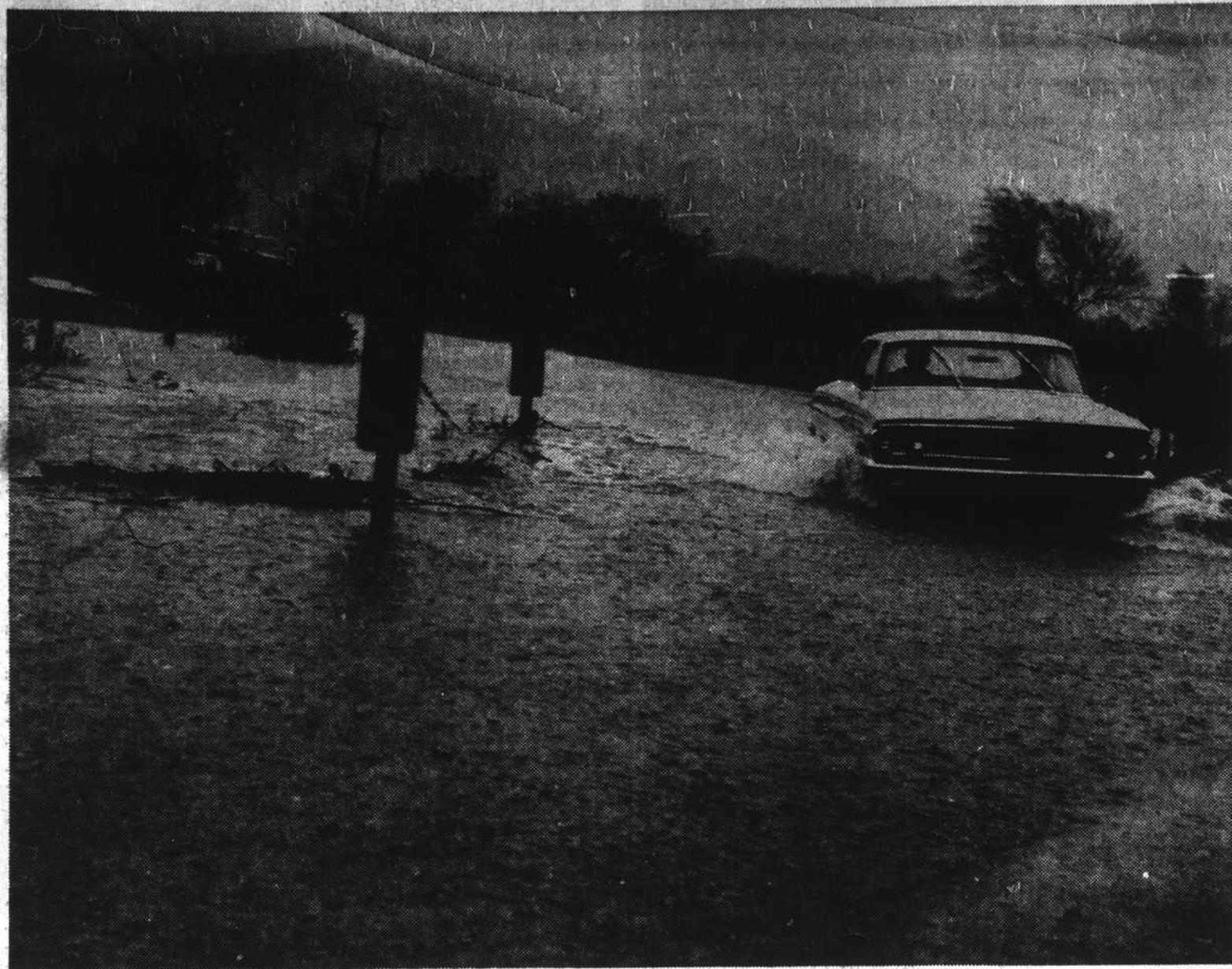
WHEREAS BRIDGES USUALLY KEEP WATER OFF OF PEOPLE, this one on Deerfield Road adjacent to the Boone Golf Course, gave up the ghost Friday and submitted to the widespread flooding. (The black and white markers out-

line the bridge.) A number of rain spectators crossed the bridge against their better judgment and sped back across it and homeward. Three drivers said they doubted that the bridge was still intact, but ventured across anyway.