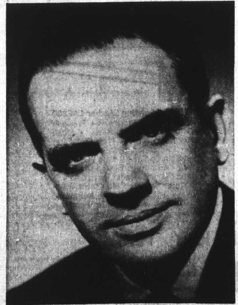
HON. FRANK CLEMENT

Gov. Clement is coming by plane to Hickory Monday, and will be escorted by Watauga County Democratic officials to Boone.