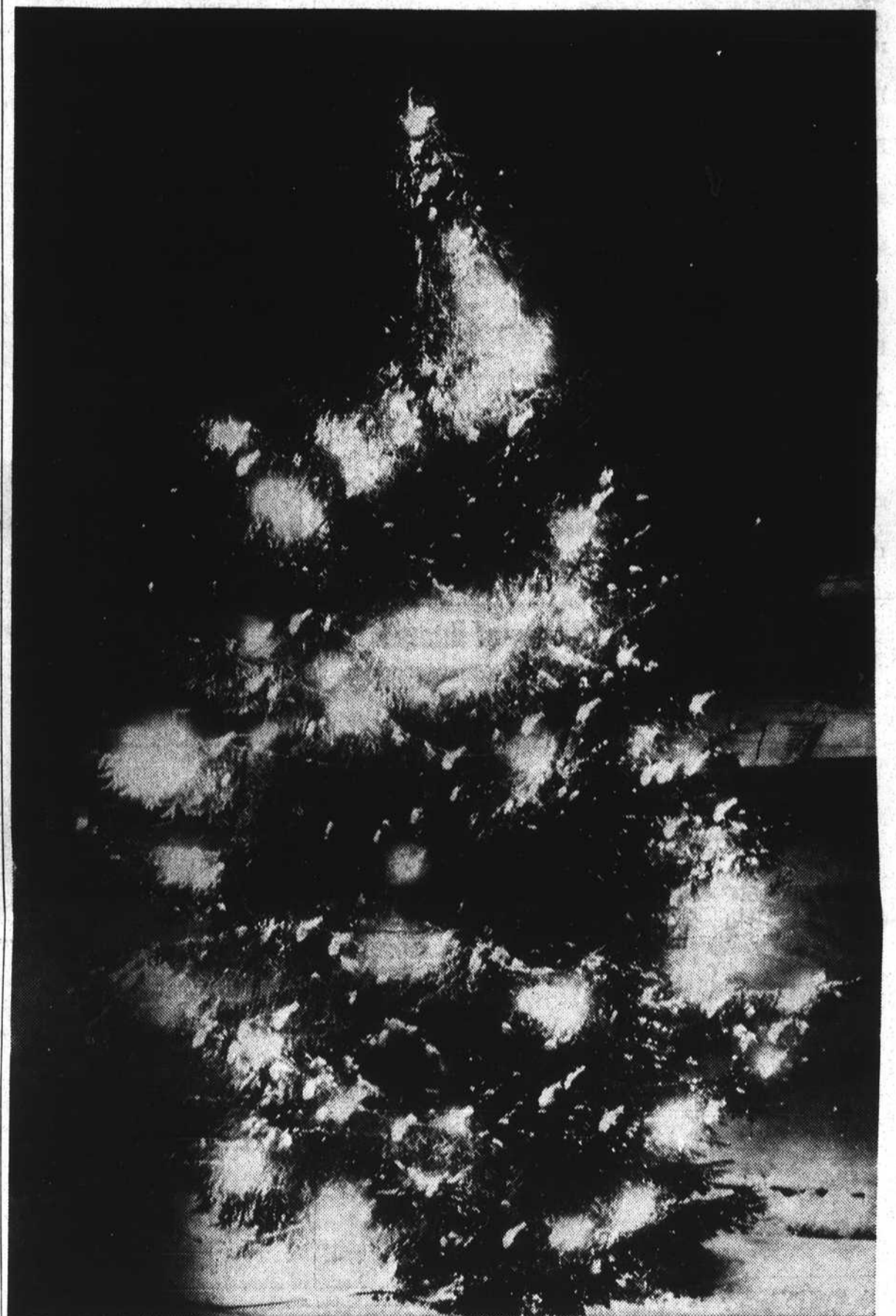
CHRISTMAS BECOMES EVEN MORE EXCITING each year when the big tree in front of the Watauga County Hospital is "turned on."