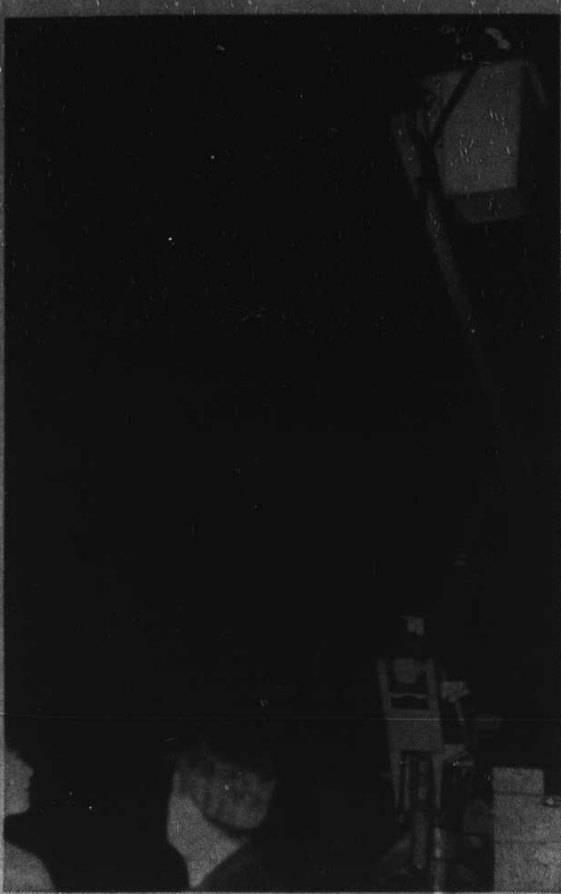
With the use of the New River Light & Power Company's "snorkle" truck, a fireman was hoisted above the store with a hose. Firemen said the truck was invaluable in confining the blaze.