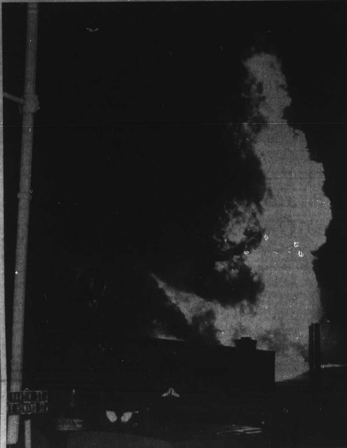
FLAMES BURST THROUGH THE ROOF OF THE WINN-DIXIE STORE on Highway 221 Sunday night. Several fire departments rushed to the aid of Boone's department standing by with extra hoses, on call to assist in case another fire were to break out.

Blackburn's comment on construction: "Plans are under consideration for rebuilding at the (Continued on page 4, Sec. C)