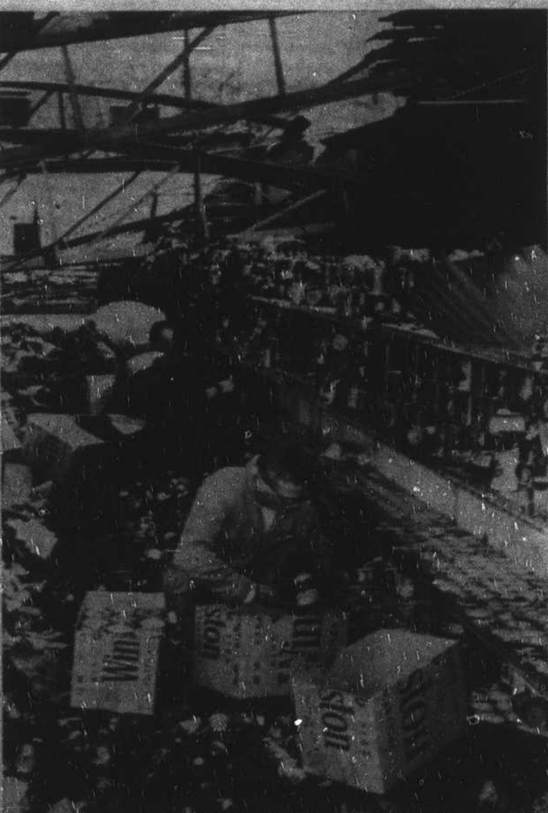
Workmen clean up ruins left when the Boone Winn-Dixie Store was completely destroyed by fire.