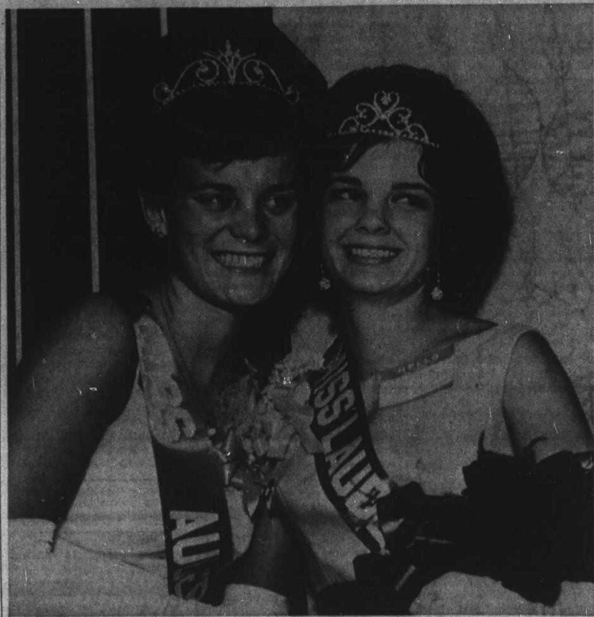
Florida Queen To Be In Blowing Rock

No one under 18 years of age will be considered. Applicants must be available for rehearsal calls every morning, afternoon, and night beginning on June 11.