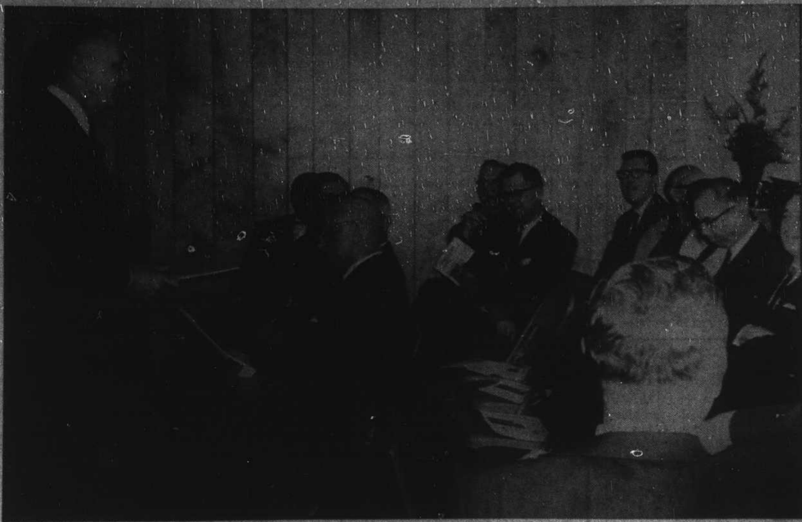
The president of the First National Bank of Eastern North Carolina visited the meeting of stockholders of First National Bank of Boone Friday, when in simultaneous meetings, the