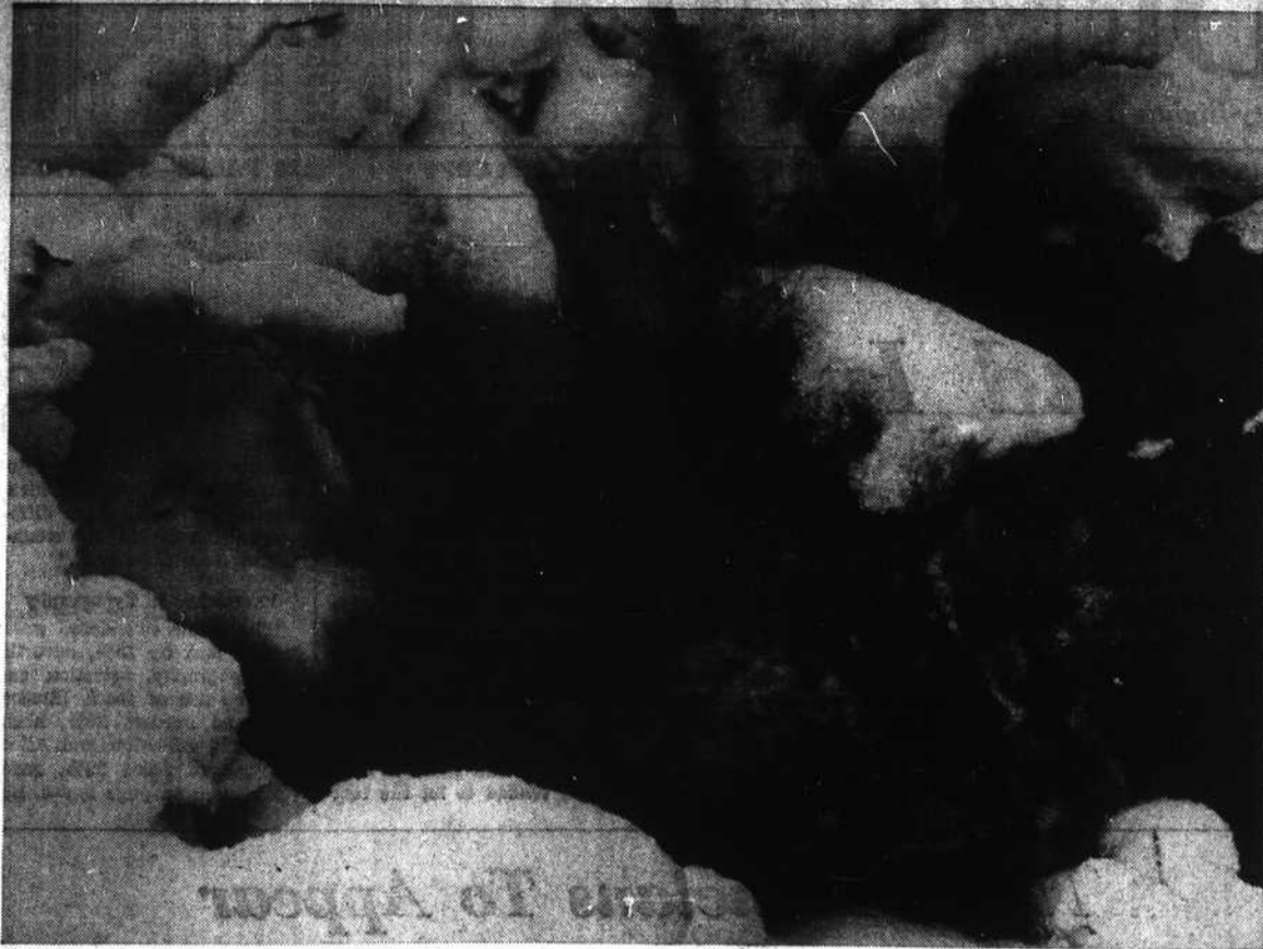
ICY SPRING WATERS BECOME EVEN CHILLIER as they splash into a snowy pool North of Rich Mountain.