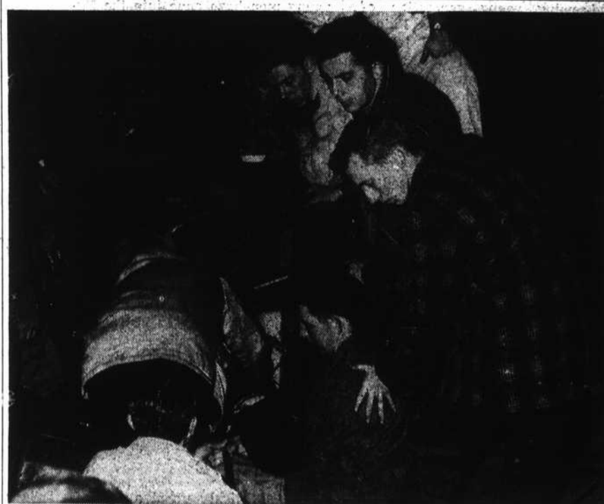
A Blowing Rock doctor leans over a young man who was pinned in the cab of a tractor-trailer south of Blowing Rock early Monday morning.

Manager Wade Meadows said the water level was within two inches of the fuse box, so officials took emergency action to pump water out of the basement. (Continued on page six)